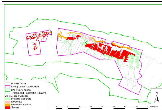
Figure 3: Spatial plan restoration: "vlok degradation map"

The spatial plan for the hill slopes restoration in the western Baviaanskloof includes quantification per farm of hectares suitable for spekboom replanting and the sum of carbon sequestration. The landowners are keen to take this plan a step forward. Besides the landowners, various investors indicated to be interested in the results of the plan what could mean this plan is another big step towards large scale restoration in the Baviaanskloof.