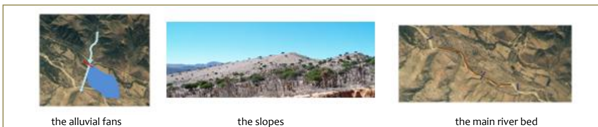
Figure 4: Implementation of measures

While these measures have been successful in protecting crops and valuable pasture land, these barriers and channels have further exacerbated the ecological degradation (such as wetlands degradation and erosion) and lowered the water table. Restoration of the nature capital is the vital to develop sustainable livelihood and land use in the Baviaanskloof.