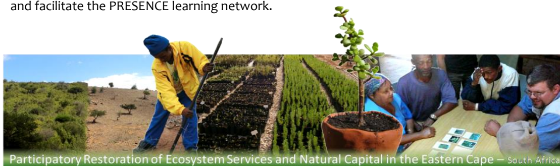
Figure 2: PRESENCE

The Water for Food and Ecosystems in the Baviaanskloof project is being coordinated by Living Lands. Living Lands is a South African Not-for-Profit -Organisation with the vision of reversing degradation and guiding the restoration of ‘living landscapes’.’Living landscapes’ exhibit a variety of healthy ecosystems and land-uses and are home to ecological, agricultural and social systems which are managed in such a way that they function sustainably. This ensures that natural and cultural resources are available for future generations. To be able to create living landscapes, Living Lands believes it is crucial to develop and create locally driven learning networks which facilitate knowledge and experience exchange, trust building, mutual understanding, collaboration and compassion. At the moment, Living Lands main focus area is the Baviaanskloof Mega-Reserve. One of the primary activities of Living Lands was/is to setup and facilitate the PRESENCE learning network.