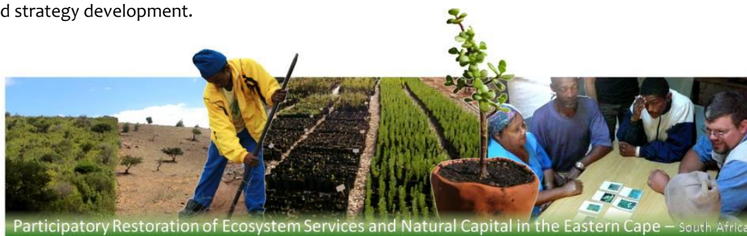
Participatory Restoration of Ecosystem Services and Natural Capital in the Eastern Cape – South Africa

The water for Food and Ecosystems project is supporting “PRESENCE in the Baviaanskloof”. This transdisciplinary initiative is being piloted across the Baviaanskloof Mega-Reserve with the support of multiple partners. “PRESENCE in the Baviaanskloof” has been applying and refining an integrated ecosystem (services) approach. The process has been focussed on the western sector and has involved area identification (e.g. hydro/ecological processes, stakeholder willingness, institutional capacity) and understanding perceptions and values of ecosystem/landscape services. PRESENCE in the Baviaanskloof is now in an implementation phase which includes analysis of opportunities/constraints and strategy development.