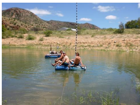
Figure 5: WUR Students using a raft to install measure gauges

The monitoring plot has been installed and finalised in 2010. The different equipment (Gerlaugh troughs, pillars for the erosion bridge, Tipping Buckets, weather station and moisture probes) are measuring bio-physical processes in the area. Over a transect of approximately 50 km several measure gauges have been installed to measure surface water. This gives an idea about the hydrological relations the surrounding and the groundwater levels.